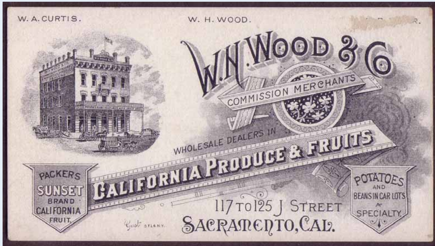
Early Black & White Card