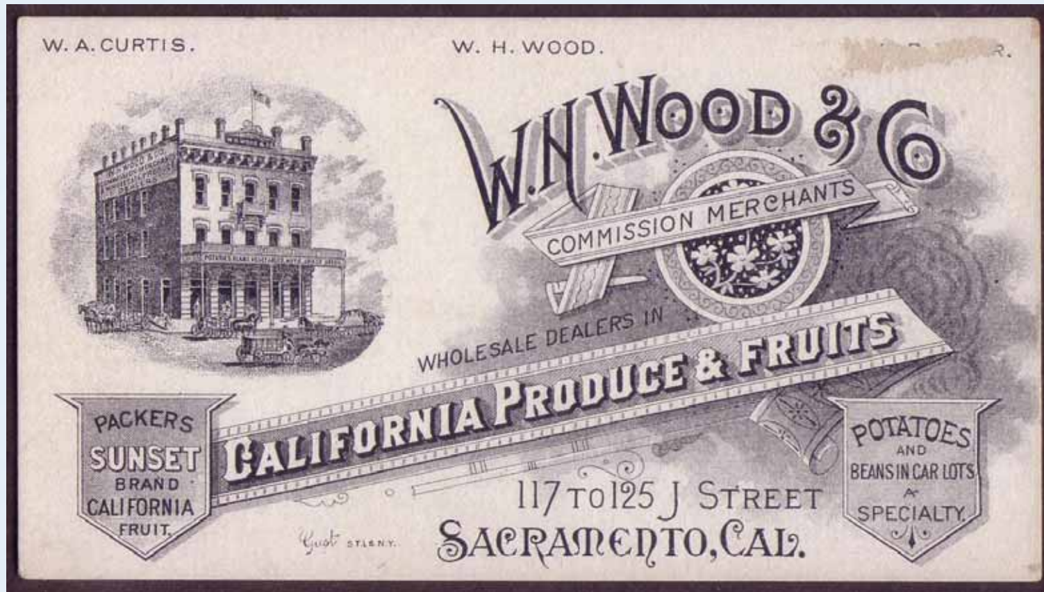
Early Black & White Card