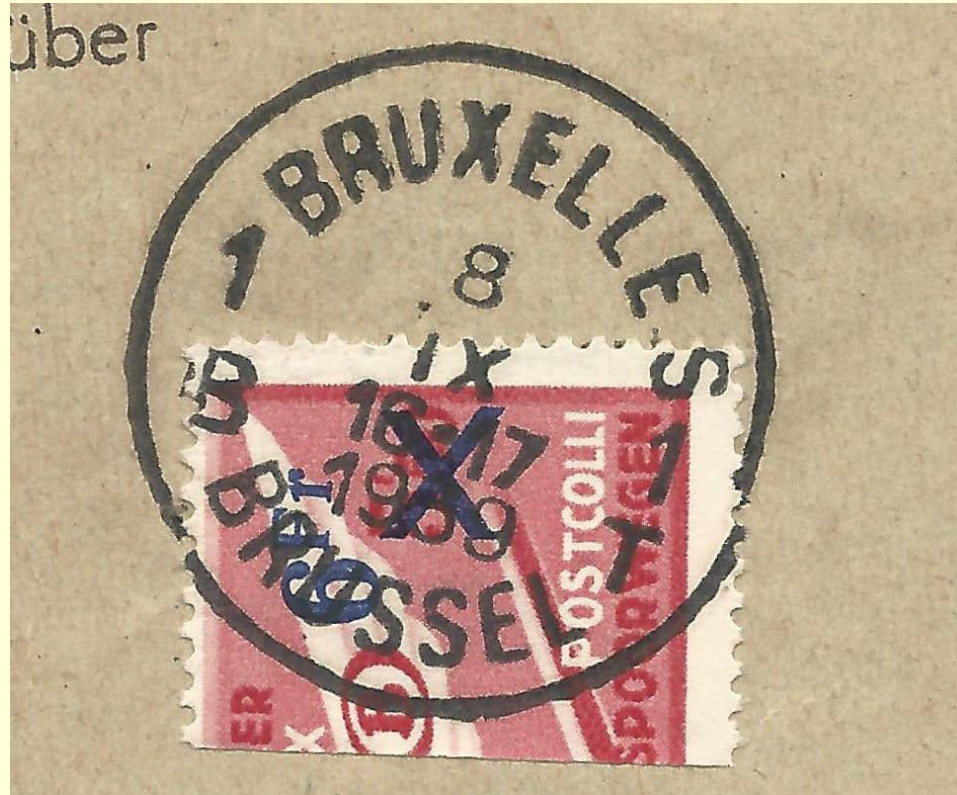
Belgium Q210a (6 Francs on 5.5 Francs) Vertical Bisect with a 1939 CDS