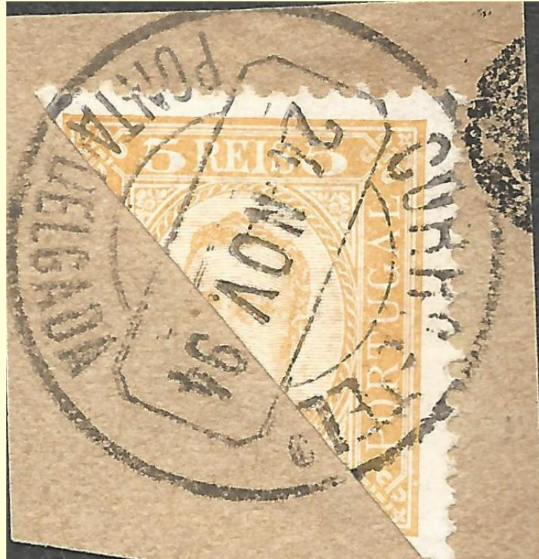
Ponta Delgada #1c (5 Reis) Diagonal Bisect with a 1894 Cancel