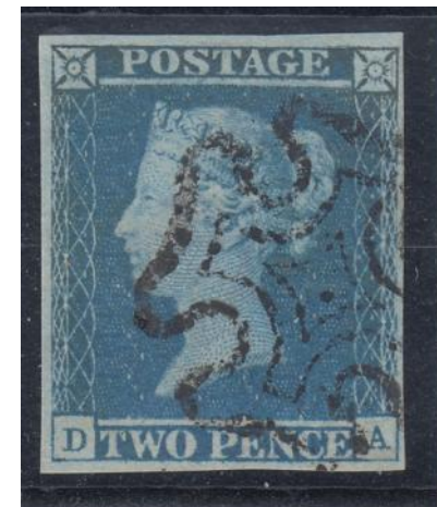
Two Pence Blue

Produced by Perkins, Bacon & Company Printed in sheets of 240