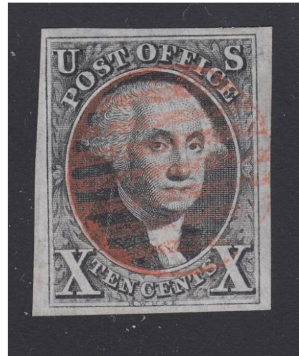
10¢ Black Washington