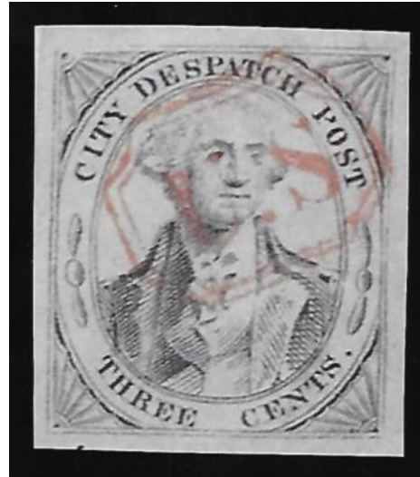
Scott #6LBI 1 st Local used as U.S. Carrier Stamp