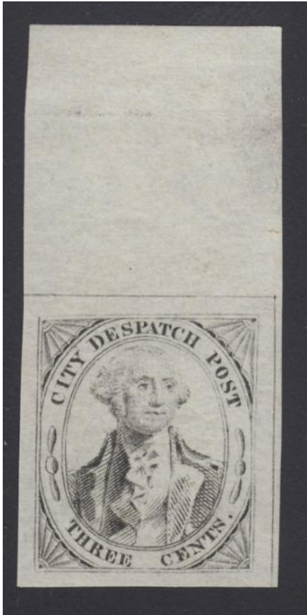
Scott #40L1 1st U.S. Local Stamp