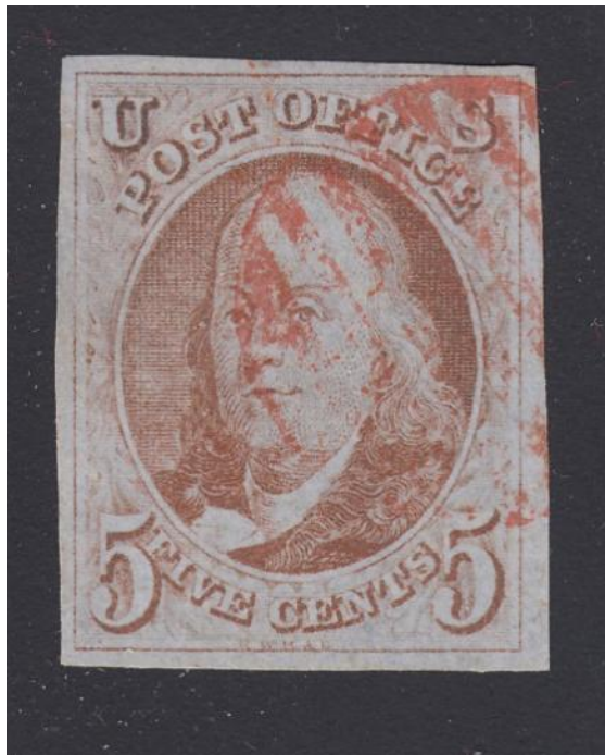
5¢ Red Brown Franklin

Produced by Rawdon, Wright, Hatch & Edson