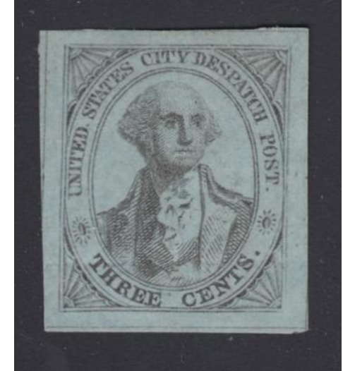
Scott #6LB3 1 st Official U.S. Carrier Stamp

ALL THREE STAMPS WERE VALID ONLY IN LOWER MANHATTAN