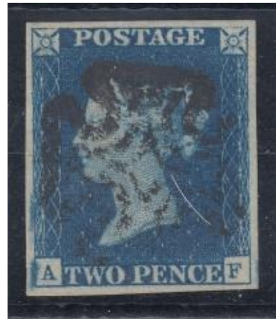
Two Pence Blue

Imperforate, Small Crown Watermark, Bluish Paper February 1841 March 13, 1841