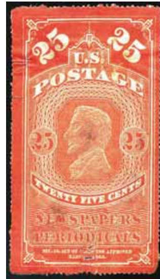
US #PR3 – most newspaper stamps were destroyed by vendor handling.