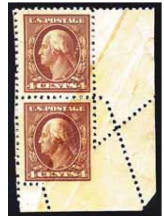
Odd shaped misperfed piece with discolored gum over the stamps and selvage.