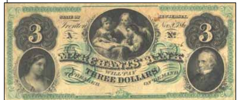
This Trenton Merchants’ Bank $3.00 bill (“Demand Note”) was a local currency printed on one side.