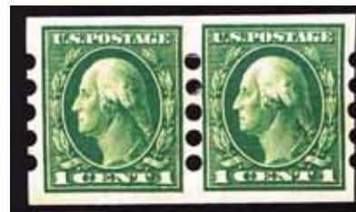
Coil pair variety from a Commercial dispenser – “Mail-O-Meter” stamps.