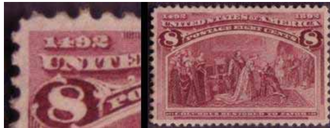
Above is a POOR example of a regummed stamp showing the added gum on the perf tips!

Some of the examples that Tom displayed were rather crude attempts to fool unwitting collectors, but most of his altered examples would deceive even the experts. Examples included stamps that had been trimmed, re-perforated or re-gummed. In one case, cardboard backings from proofs of US Officials were carefully removed and passed off as regular stamp issues.