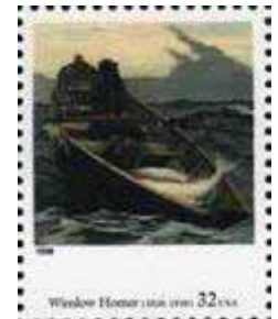
"The Fog Warning"