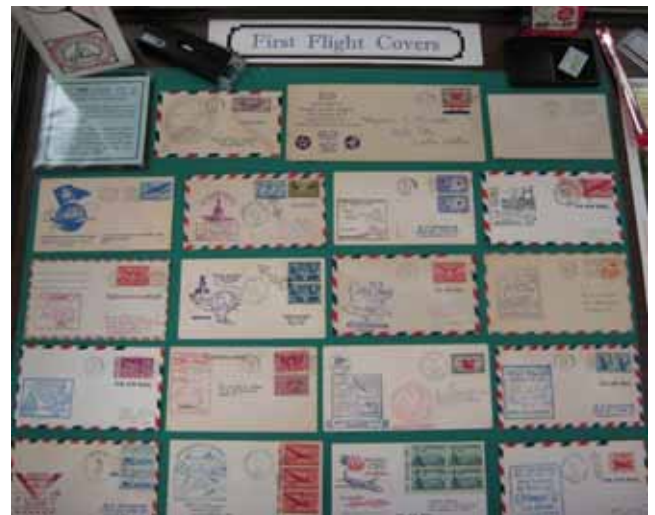
First Flight Cover Exhibit at the Hamilton Library.