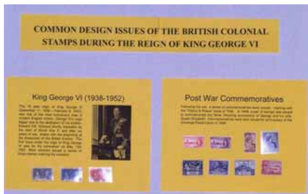
Portion of winning exhibit from HAMPEX '07

Everyone had a good time and a welcome break from the heat. For those who missed it, the winning exhibit will be displayed again at our September meeting.