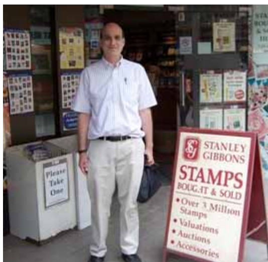
Unidentified HTPS Member loitering near 399 Strand in London's West End

I counted five large stamp dealers within a three block radius, centered on the Stanley Gibbons shop. How many stamp shops are left in New York City or Philadelphia?