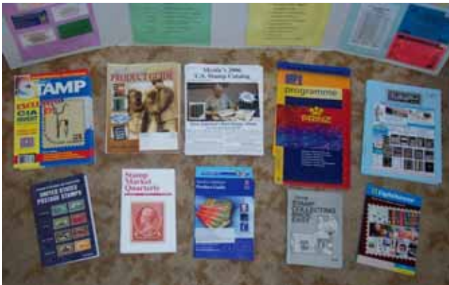
Some of the Donated Publications & Catalogs

Before the talks began, members could look at some of the tools and examples used for the demonstrations. A poster board described some basic techniques including how to distinguish between U.S. Flat Plate and Rotary Press stamps. There was also a write-up on the layout and identifications of the single and double line U.S. watermarks.