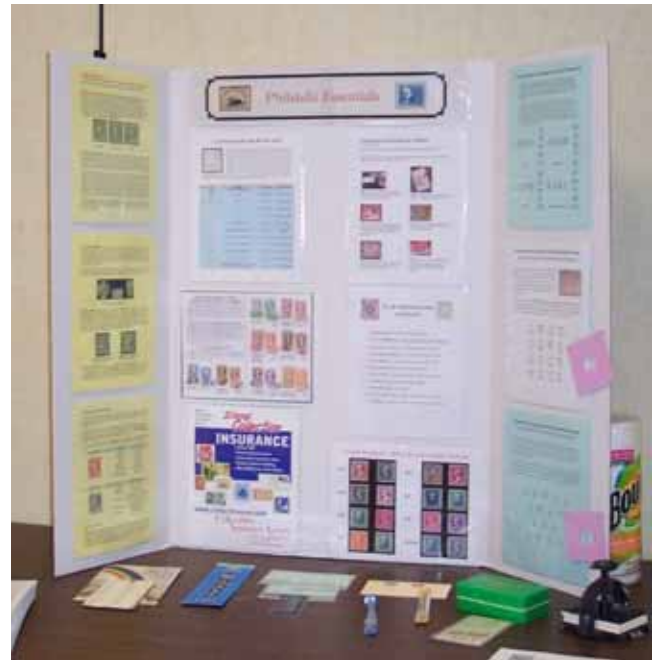
Poster Board on Philatelic Essentials

He also uses it to remove scotch tape (ouch!) from stamps. He found that it leaves a white powder residue that can be brushed off.